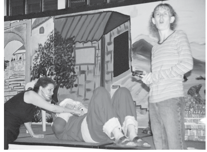
Despite the efforts of the nursing staff. Santa was unable to continue and had to return to the hospital in an ambulance.