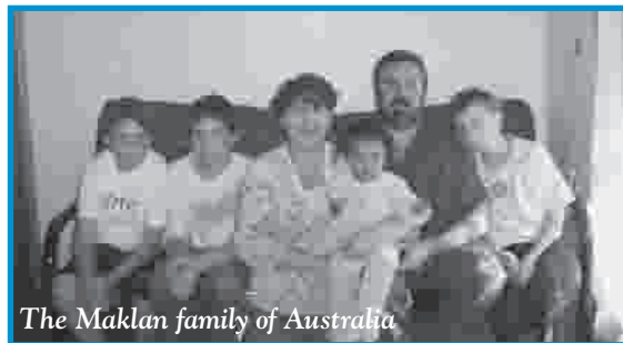
The Maklan family of Australia